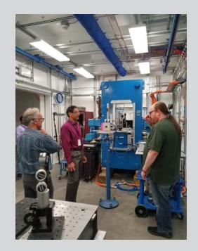
MAP at XPD