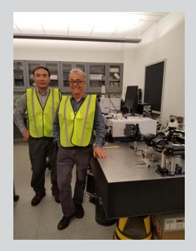
Offline IR Lab