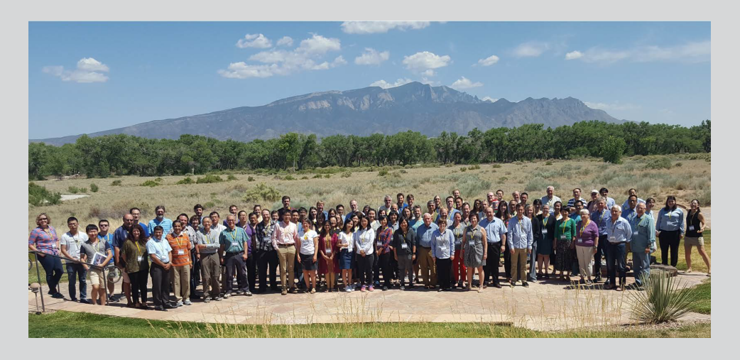
COMPRES 2016 Annual Meeting, Tamaya Resort, NM