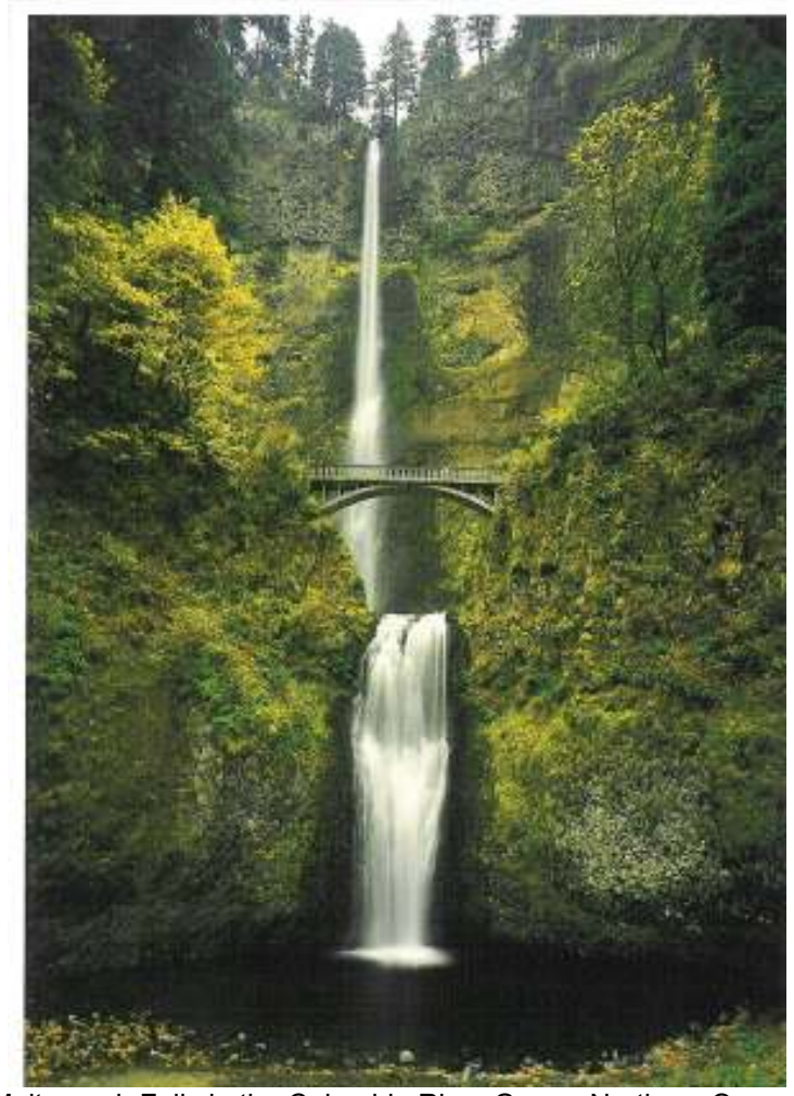
Multnomah Falls in the Columbia River Gorge, Northern Oregon