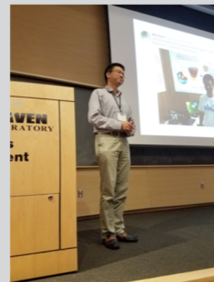
Bin Chen "Elasticity of single crystal ice VII synthesized in externally-heated diamond anvil cells"